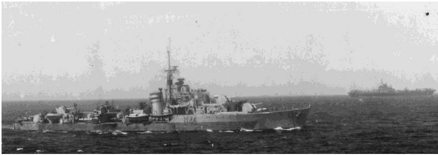
HMS Tenacious with HMS Indomitable off Sumatra 1945

Immediately after hostilities ceased, Tenacious was involved in the repatriation of POWs from Japan followed by a few months in China.