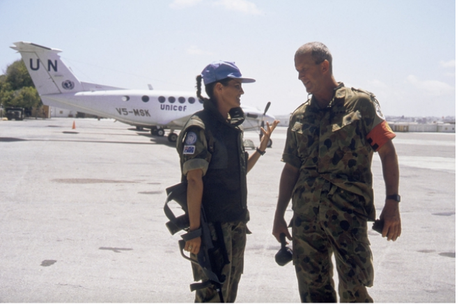
Two images from the Australian War Memorial showing the diverse nature of the Somalia operations, the protection and security roles of the 1 RAR Battalion Group and the movement control mission.

Around 1600 ADF personnel served in Somalia. One soldier was killed accidently and three were wounded.